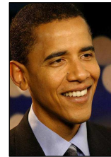
Senator Barack Obama