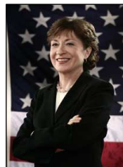
Senator Susan Collins