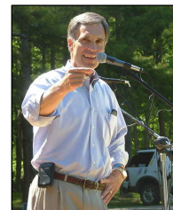
Rep. Tom Allen