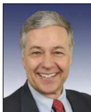
Rep. Mike Michaud